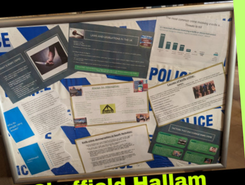
Sheffield Hallam University