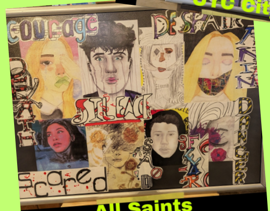
All Saints Highschool