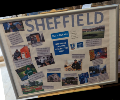
SWFC Education Hub